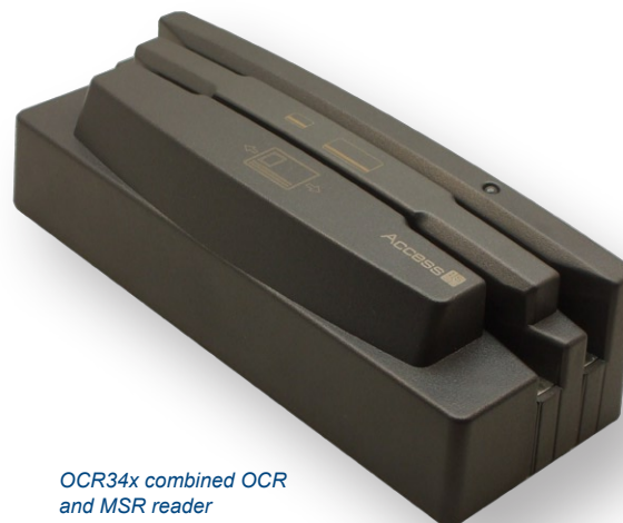
OCR34x combined OCR and MSR reader